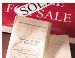
Home loan EMIs to rise by 6k cr